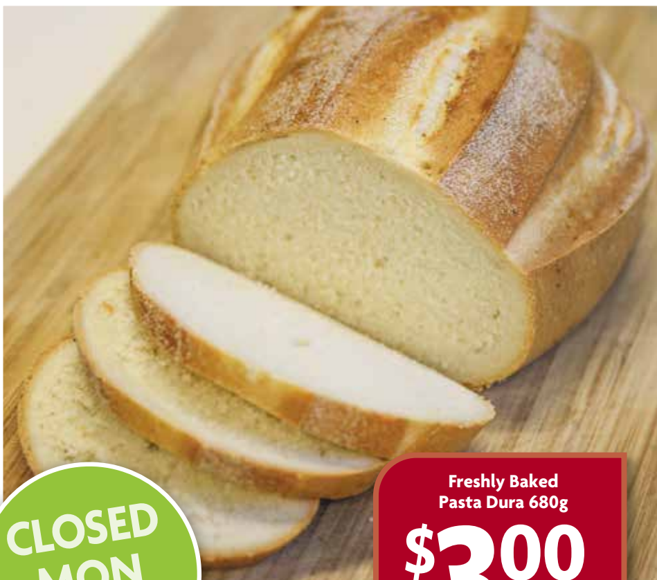
Freshly Baked Pasta Dura 680g