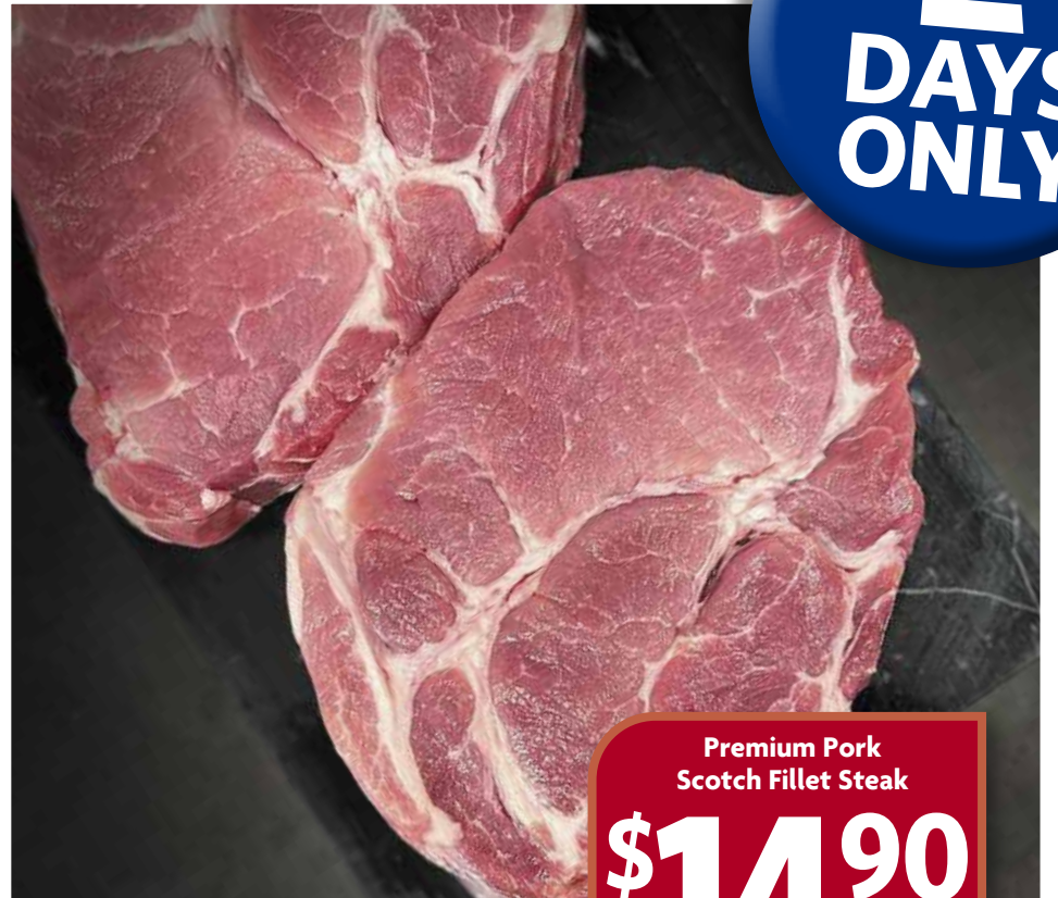
Premium Pork Scotch Fillet Steak