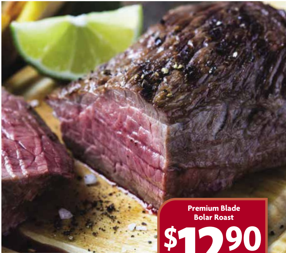
Premium Blade Bolar Roast