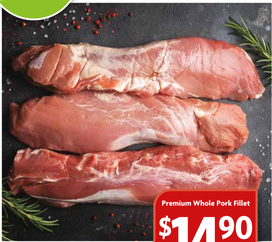
Premium Whole Pork Fillet