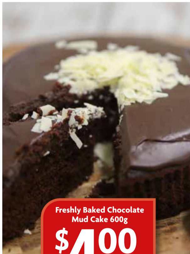
Freshly Baked Chocolate Mud Cake 600g