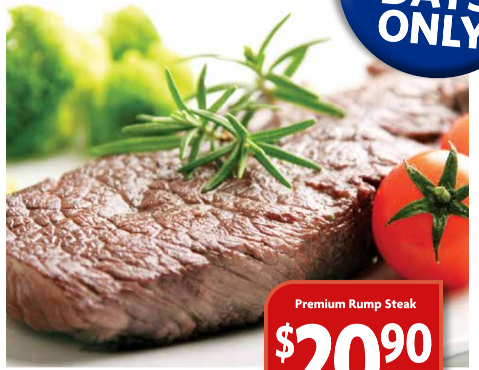
Premium Rump Steak