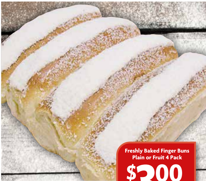
Freshly Baked Finger Buns Plain or Fruit 4 Pack