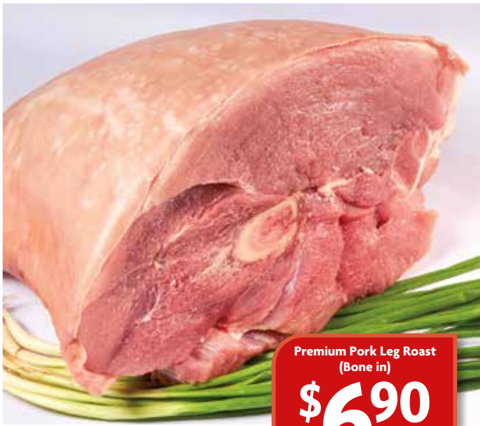
Premium Pork Leg Roast (Bone in)