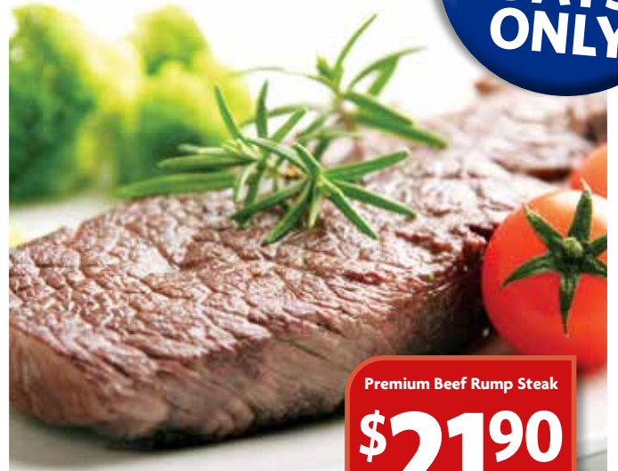
Premium Beef Rump Steak